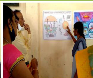
Poster Presentation Competition